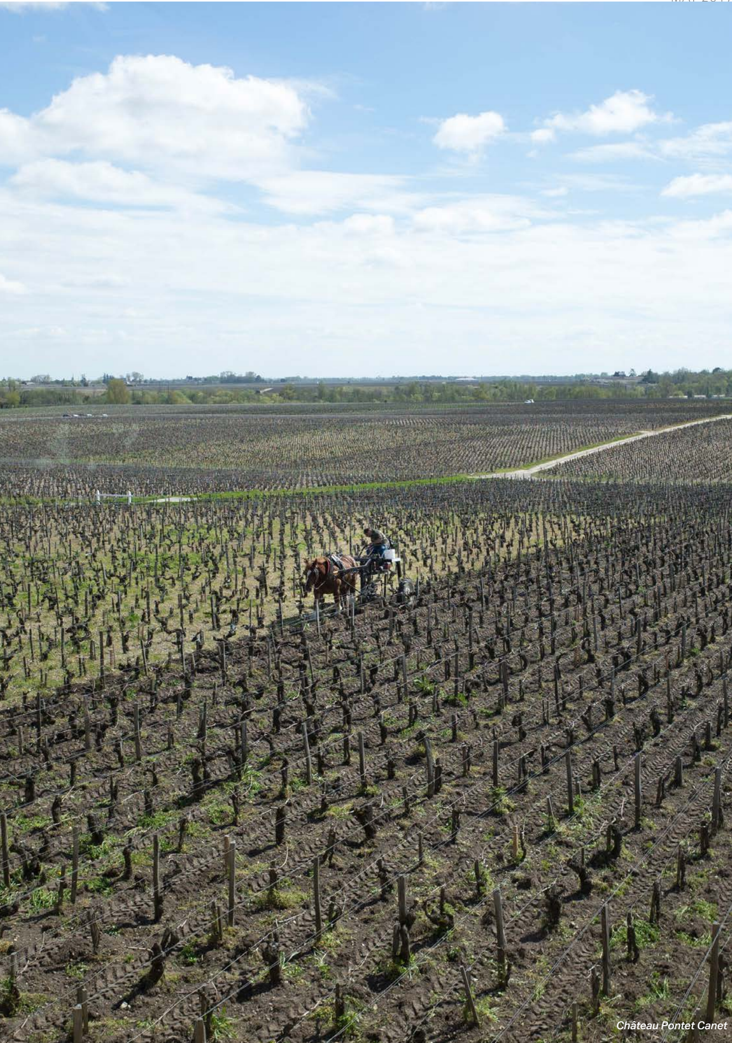
Château Pontet Canet

Tasted at Château Pontet Canet, 4th April 2017 N / R Deep shade, clear appearance; bright and fresh on the nose, dark fruit, with an odd note that I can't put my finger on; bright on the palate, very ripe fruit, even a little hint of sur maturite I felt. Mostly superb fruit expression however. Juicy and vibrant, with fine tannins. Good length. Probably very good, but there's something I'm just not sure about, so I will reserve my opinion until this 2016 is in bottle.