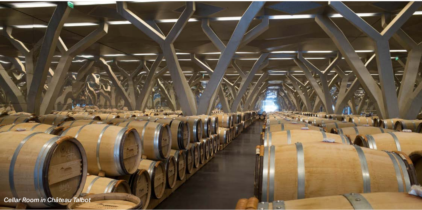
Cellar Room in Château Talbot