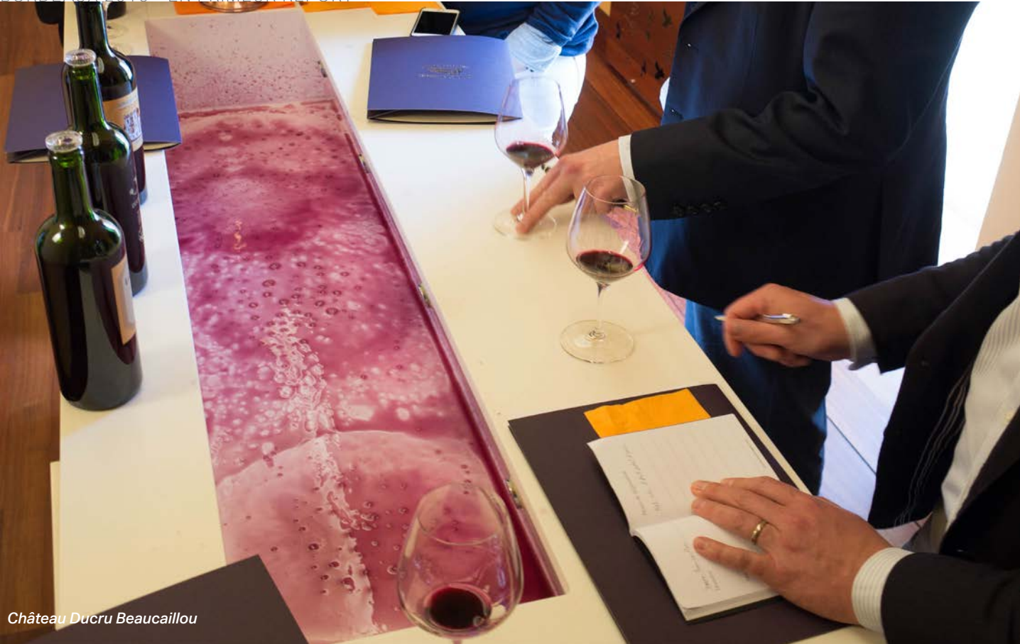
Château Ducru Beaucaillou