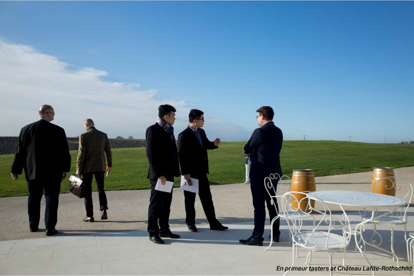
En primeur tasters at Château Lafite-Rothschild

Fine crimson; lovely plummy nose, summer pudding fresh aromatic intensity; very fine-textured, ripe, grippy, lovely flesh. This is terrestrial rather than celestial Lafite. Some inner mouth florals – violets. Quite classic, concentrated, but ultimately elegant, effortless Lafite. Real freshness.