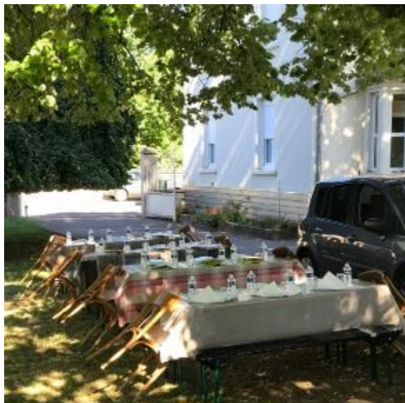
↑ 4 Sep 2020 – Table in the shade at Dom. Emmanuel Rouget tray for lunch.