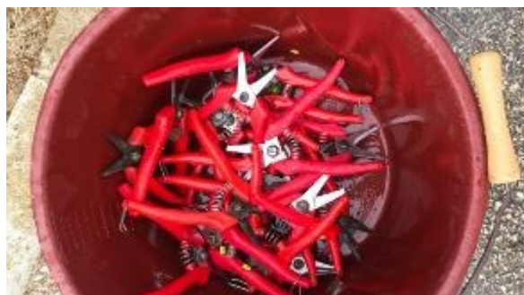
↑ Everything is hand-picked at Claude Dugat, and solely by their own team of experienced and careful pickers. No sub-contracting of picking to a company here, they supervise everything personally.