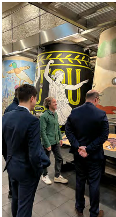
Château Carmes Haut-Brion... Graves x hipster