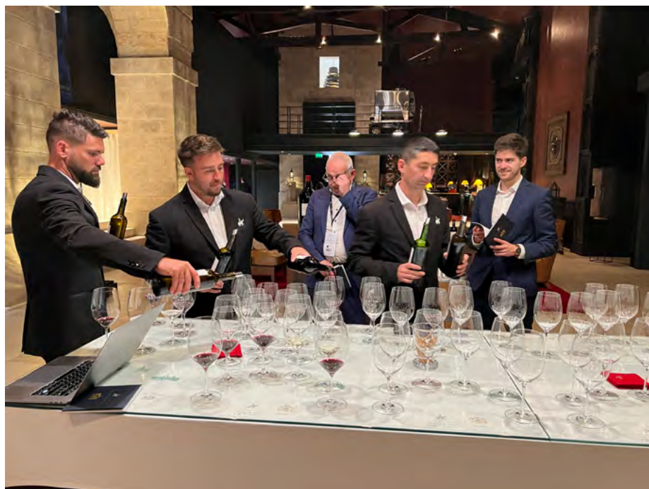
Château Cos d'Estournel choreography