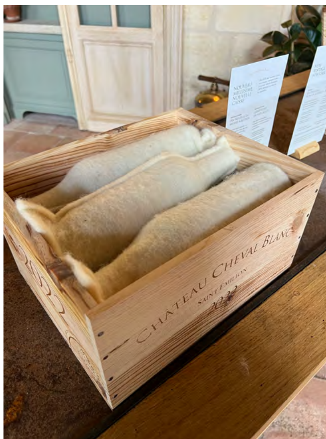
Château Cheval Blanc, now sporting woolly socks