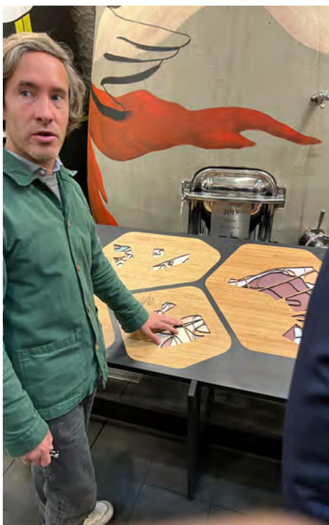
Château Carmes Haut-Brion... the hand of nature

Fine full fairly solid ruby; pure, deep, rather brooding yet fruity aroma, dark and curranty aroma, plus a cool verdant tone running over the top of that base, a little hint of cocoa emerges with air, as well as violet; fine, fleshy, with very fine-grained structure hidden by fruit and sap, the finish is long and persistent with dark berry fruit, a touch of spice, and a brightness and energy that is impressive. This has the density of fruit and the fine structure to age well, but at the same time, a perfect sort of freshness and balance – there is nothing extreme in the wine.