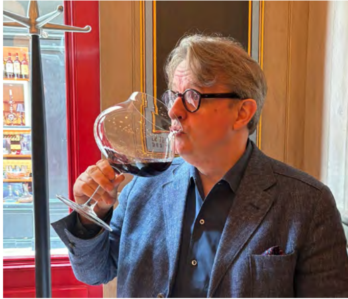
Just one glass....