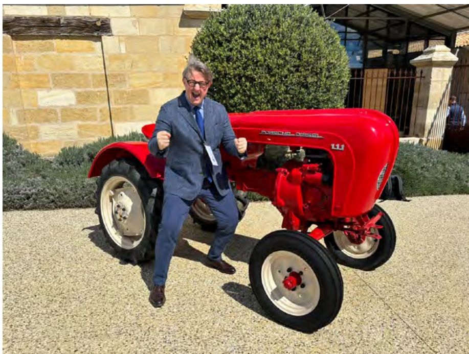
Château Le Gay... Porsche power!