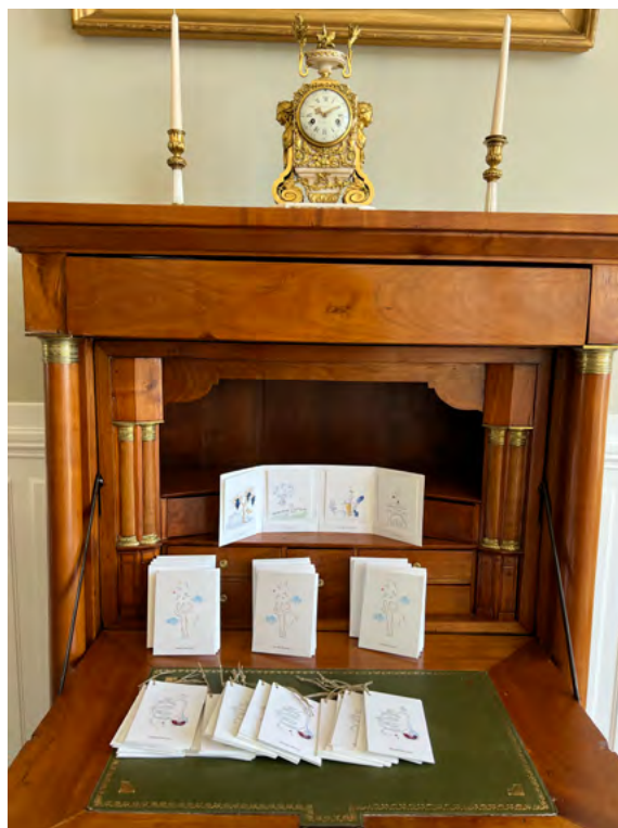
Château Nenin, booklets for the Delon family properties