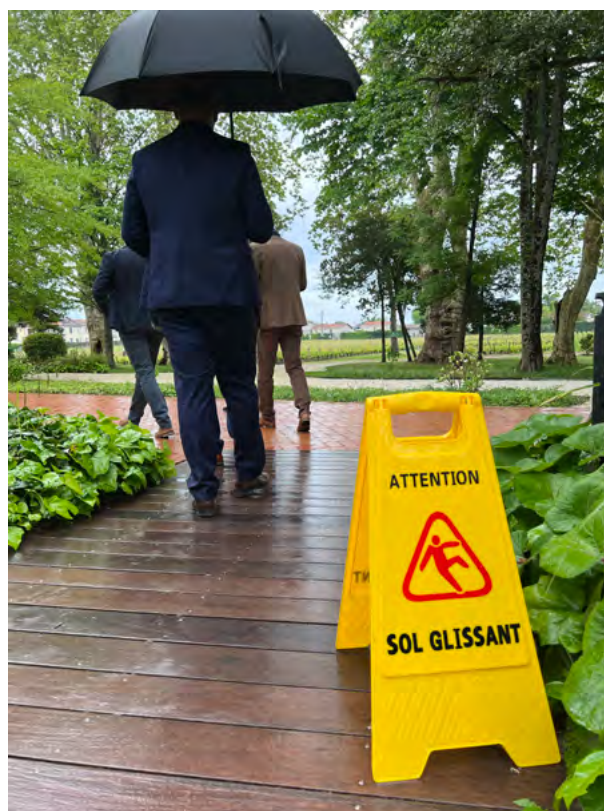
Bordeaux is on the Atlantic

The penny dropped for me at Latour. Tasting '23s château to château, it's easy to become inured to the character of the vintage because that's the one constant you face all day, sample to sample. The vintage's personality is hidden in plain sight because all the wines tasted are from the same one. It's hard, at times, to step back. But at Latour they always show the three wines of the vintage (2023 Latour, Les Forts de Latour, Pauillac), and also these same three labels from their current ex-Château releases – in this case 2017, 2018, and 2019 respectively. (Latour exited the primeurs system years ago, but still takes the opportunity to show the new wines). Both 2019 and 2018