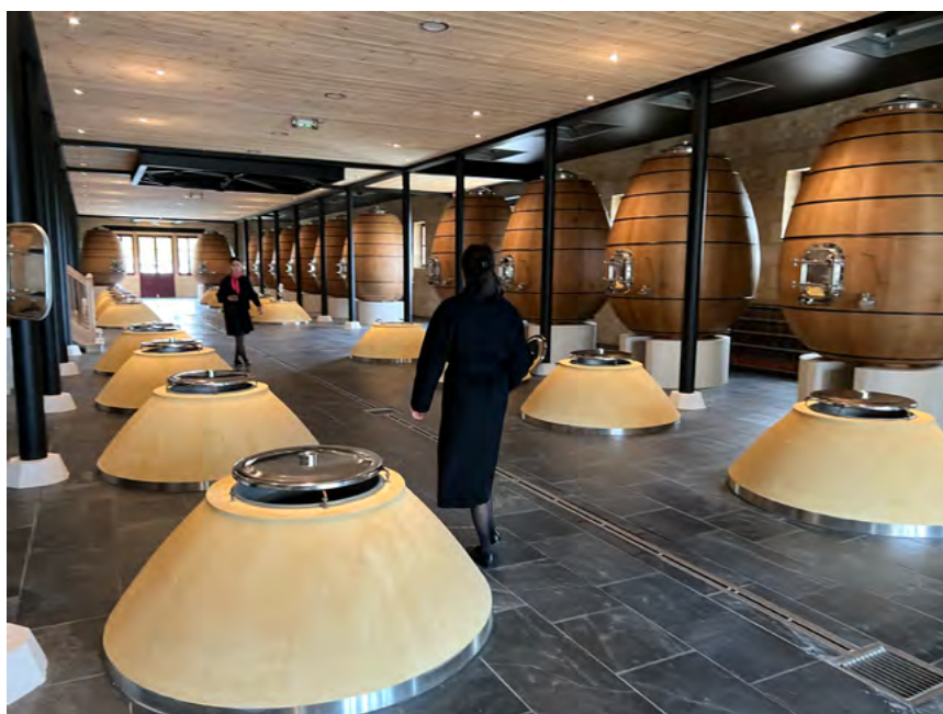
Château Pontet Canet

A deep full ruby-crimson; the 2023 Pontet-Canet shows clearly the personality of the property, beginning with an intriguing aroma, real wild fruit expression, a touch of spice, highly individual, and with a little VA lift; the palate is fleshy, with a really lovely texture that is both supple and stretchy, with good harmony and energy, good freshness of fruit, and very fine sweet tannins that melt at the end. Pontet Canet followers will find their wine here, with fine equilibrium, purity, and clarity of expression.